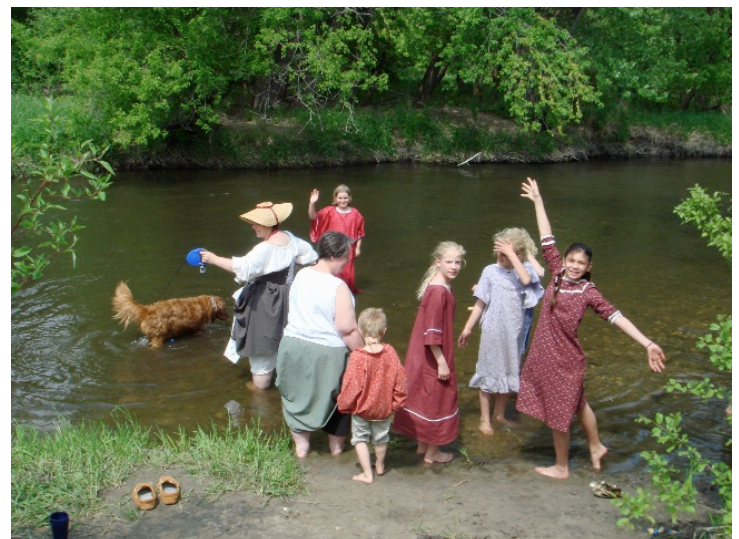
Creekin' on a warm afternoon