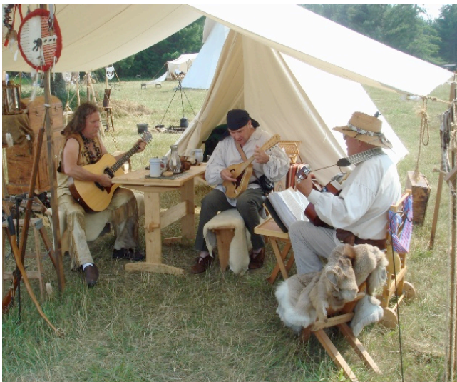
The Better Than Nothing Band practicing

From Northfield: Hwy 19 east to Hwy 19/56 (Stanton). Left (north) on Hwy 19/56 to the Hwy 19 split. Right (east) on Hwy 19 1/4 mile to Whitson Farm on the left.